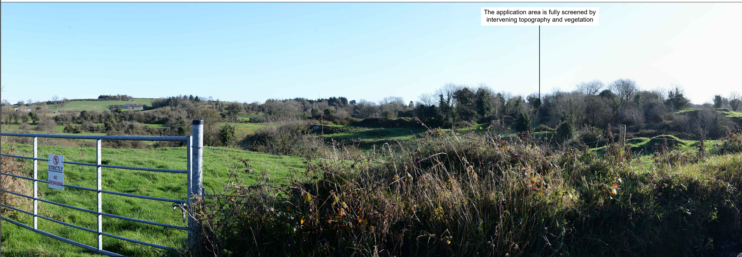
VIEWPOINT D: Local road west of the application area - approximately 380m north-west of the northern corner of the application area Grid Coordinates (ITM): 652001:800212 Approximate Elevation: 142m AOD Distance from planning application boundary: 380m Direction of View: South-East Date/time of photograph: 15/11/2022 @ 13:55 Description: The application area and therefore the proposed quarry void are fully screened in views from this local road, north of the application area, by intervening topography and vegetation. This includes views from all residential properties along the northern end of this road.

NOTES 1. EXTRACT FROM O.S DISCOVERY MAP NO. 34 & 35 2. ORDNANCE SURVEY IRELAND LICENCE NO. CYAL50248253 (C) ORDNANCE SURVEY & GOVERNMENT OF IRELAND