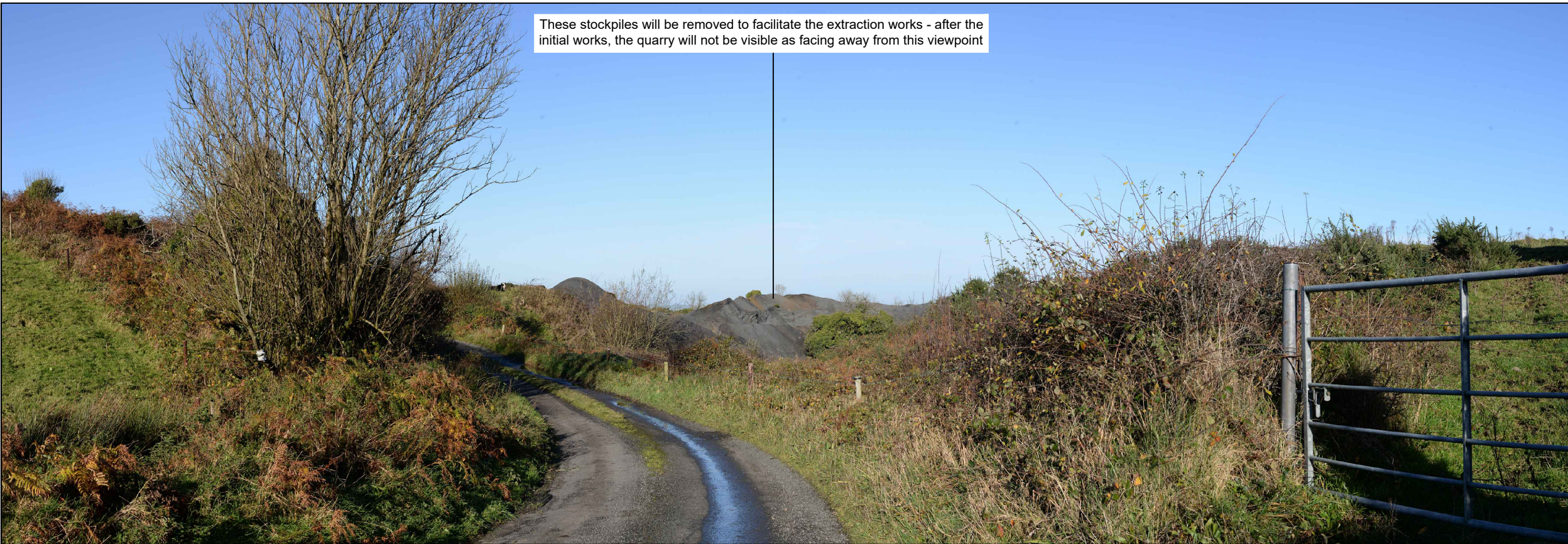
VIEWPOINT C: Local road west of the application area - in the vicinity to the southern corner of the site Grid Coordinates (ITM): 652298:799534 Approximate Elevation: 175m AOD Distance from planning application boundary: 30m Direction of View: North Date/time of photograph: 15/11/2022 @ 12:10 Description: This viewpoint represents views from a short section along this local road in the vicinity of the western boundary of the application area (ca. 150m). There are no residential properties along this section of road and no views from locations further south, due to intervening topography and vegetation. Parts of the existing stockpiles along the southern boundary of the application area are visible in these views, but the majority of the site is screened by topography. The stockpiles would be cleared to facilitate the extraction works. The initial works would be visible, but all activities would soon be screened by topography, i.e. when a depth of approximately 5m within the south-western corner of the extraction area is reached. No parts of the quarry void would be visible in views from this road. A proposed screening berm and associated native woodland planting along the western boundary (screened by the tall shrub to the left of the road in this view) would provide additional screening of the site.